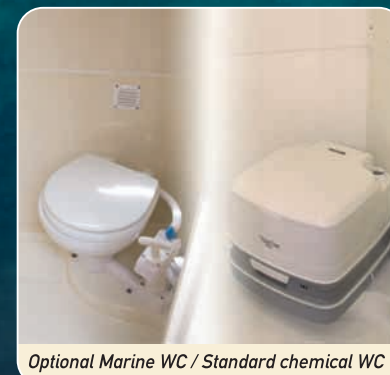
Optional Marine WC / Standard chemical WC