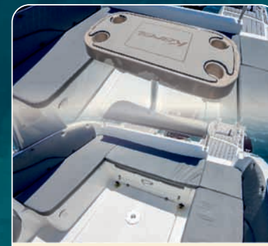
Table or free space arrangement in the aft deck